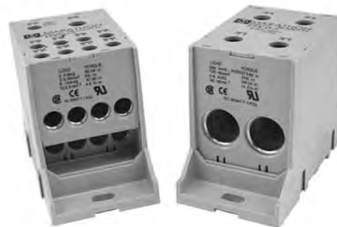
Shown left to right: EPBAD74, EPBAD71