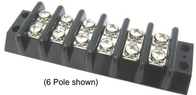
(6 Pole shown)