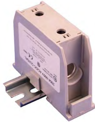
Shown here on Din Rail

Listed Enclosed Power Splicer Block 200 Amps, 600 Volts (AC/DC) 1,000V AC/DC CE (IEC 60947-7-1) DIN Rail mountable on 7.5 x 35 mm rail.