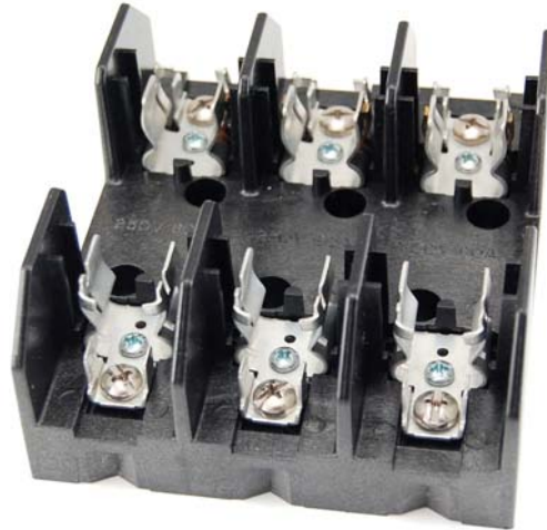
3 pole shown