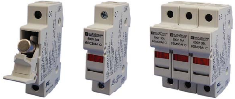
Shown left to right: 6SM30A11-C with fuse (fuse not included), 6SC30A11-C (indicating); 6SM30A31-C (indicating)

The Class CC and Midget Enclosed Fuse Holders have IP20 protection for all rated wire sizes. In addition, they are approved for use with multiple wires.