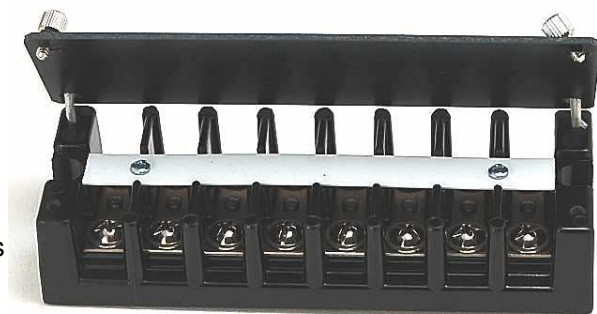
8 pole shown